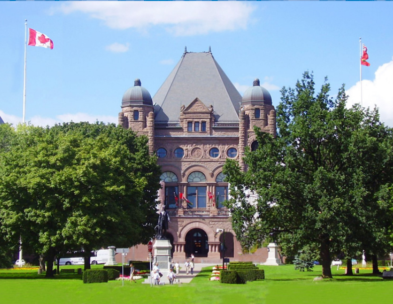
The Legislative Assembly of Ontario Toronto, Ontario, Canada

T he Legislative Assembly of Ontario (OntLA), located in Toronto, Canada, is the seat of Ontario's provincial government. Its Legislative Security Service is responsible for upholding safety and security on the legislative grounds as well as in its buildings. They respond to and document approximately 2,300 incidents each year, ranging from presidential visits, to protest demonstrations, to medical emergencies. With such a wide array of incidents posing varying degrees of security risk, many of them highly political, OntLA relies on PPM 2000's Incident Reporting & Investigation Management software solutions to track, analyze, report and prevent incident activity.